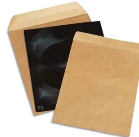
Imageries (radio, IRM...)